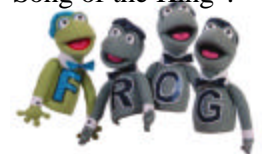
(Fully Rely On God)

Song of the King : A classic confrontation of good vs. evil set in medieval times in a witty, compelling story about Truth, Relying on God and experiencing Freedom in Christ . (for 2007)